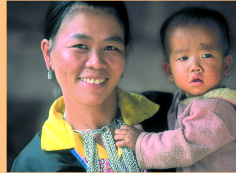
Life is Precious

They can set an appointment for you and provide complete information about proper breast health.